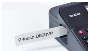
Automatic label cutter

A large colour LCD display with label preview function, and a wide PC-style keyboard make it easy to quickly produce your labels in various colour and size combinations.