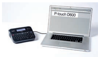
Print labels from your PC or Mac