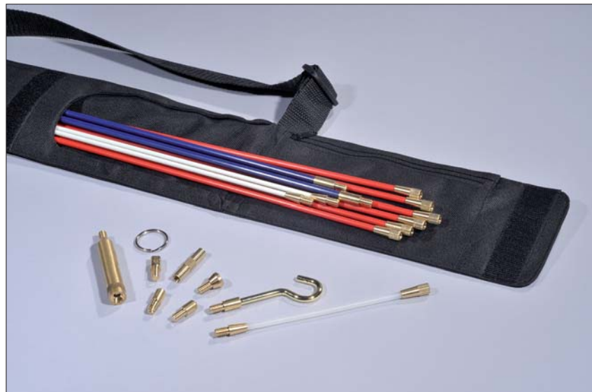
All components stored neat and tidy with the Rod Set Deluxe.

The Rod Sets are a professional cable installation tool which enables installation jobs to be done in record time even in the most challenging environments. Rods made of glass reinforced plastic (GRP) are able to pull a cable weight of up to 80 kg. The product also allows its user to inspect, illuminate and retrieve. The complete system integrates rods, a variety of useful attachments and a bag to store all parts in one place.