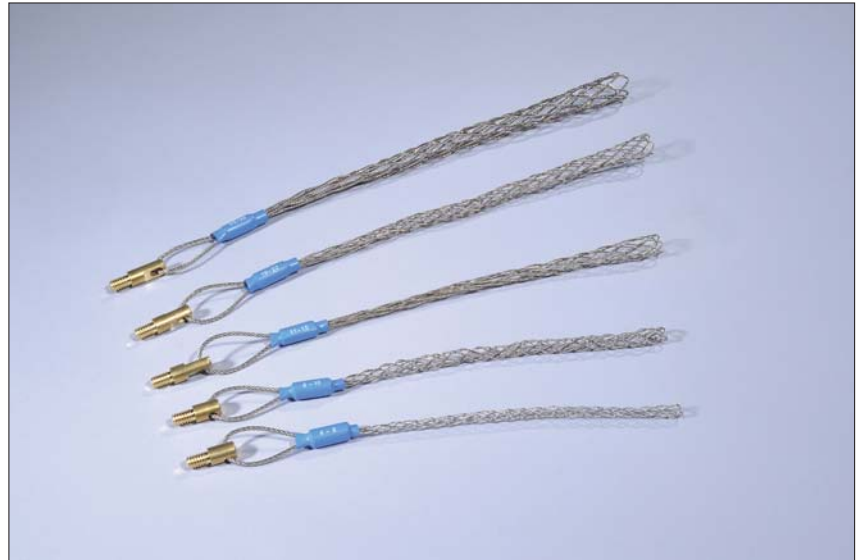
Cable Grips are available in five different sizes to attach a wide range of cable diameters.

Cable Grips are designed to grip objects from the outside and provide a very reliable super fast method for securing pipes and cables to the rods. Just open a grip by compressing the braided sleeving, push it over a cable and let go, the material will contract immediately and establish a tight fastening of the cable to the tool.